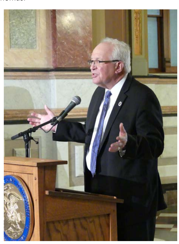
Senator Pat McGuire, Chair, Senate Higher Education Committee.